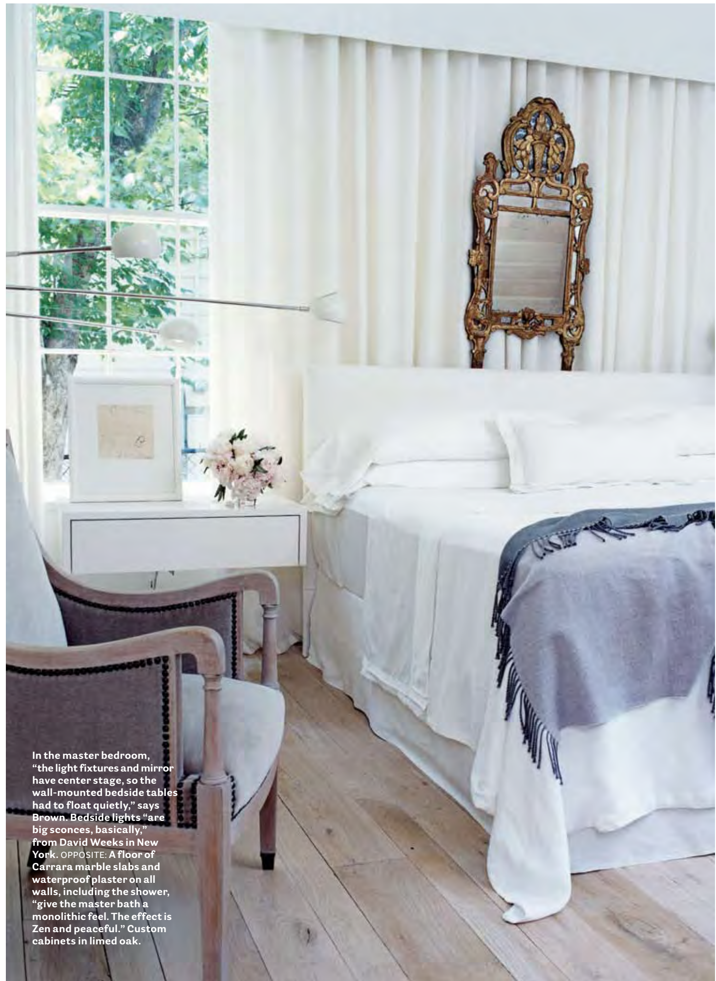
In the master bedroom, “the light fixtures and mirror have center stage, so the wall-mounted bedside tables had to float quietly,” says Brown. Bedside lights “are big sconces, basically,” from David Weeks in New York. OPPOSITE: A floor of Carrara marble slabs and waterproof plaster on all walls, including the shower, “give the master bath a monolithic feel. The effect is Zen and peaceful.” Custom cabinets in limed oak.